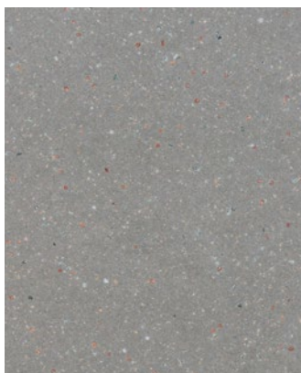
Incora IN 100

During the manufacturing process, the still-moist panels are sprinkled with high-quality granulated marble that gives them a unique and dynamic look. Every Incora panel is one-of-a-kind. The granulate becomes perfectly embedded into the fiber matrix as the panels are pressed. To ensure longevity, in a final step the panels are finished with a transparent high-scratch resistant coating that also serves as protection against weather and UV radiation.